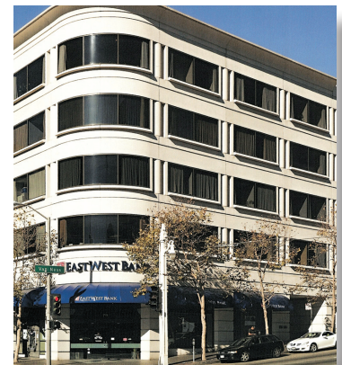
New Building at 777 Van Ness Avenue